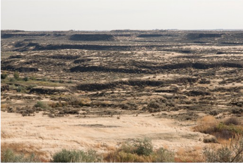
Typical landscape of the Channeled Scablands, as seen in the Drumheller Channels National Natural Landmark

The Channeled Scablands are probably the least known of the seven wonders of Washington State, but they have the most fascinating geological story. I still meet people today who grew up in the Seattle area that have never heard of them. What are they? Most of eastern Washington State is either farmland or mountains, but then there are large swaths of the landscape where all you can see is barren bedrock and strange rocky land formations. The early settlers in eastern Washington referred to these areas as scablands because they were