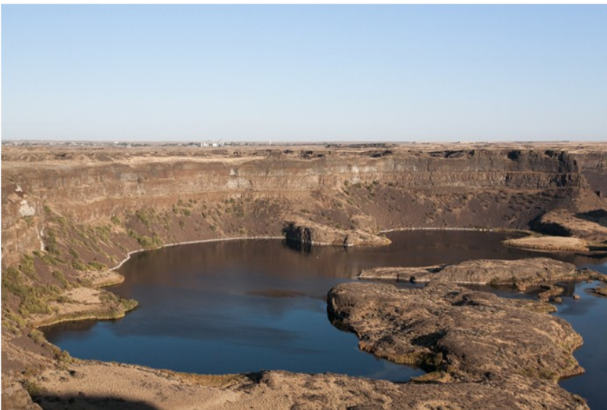
One section of Dry Falls, which was the largest waterfall in the world about 10,000 years ago