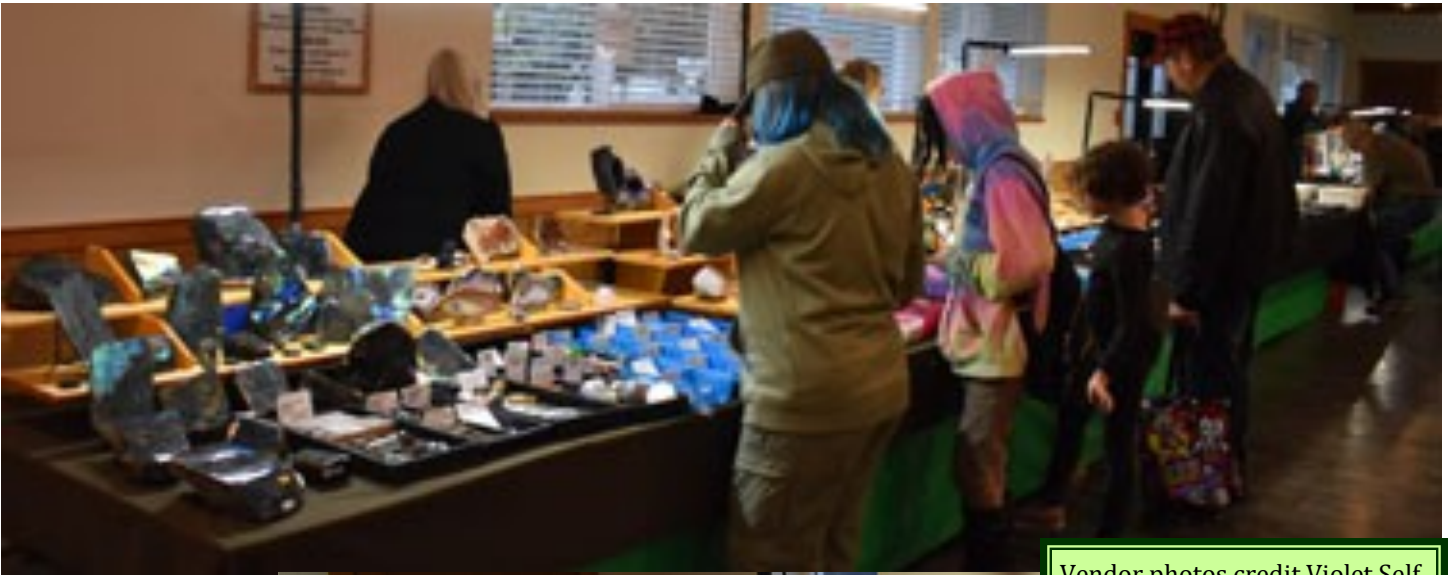
Vendor photos credit Violet Self