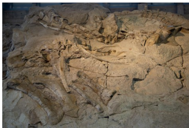
Large bones resembling legs, ribs and vertebrae protrude from grayish brown rock