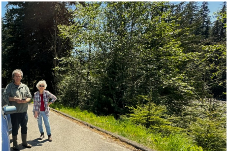
Article contributed by Peggy Peterson

If you sign up for a trip, please call the leader if you are going to be late or if you aren't able to make trip. It's the courteous thing to do.