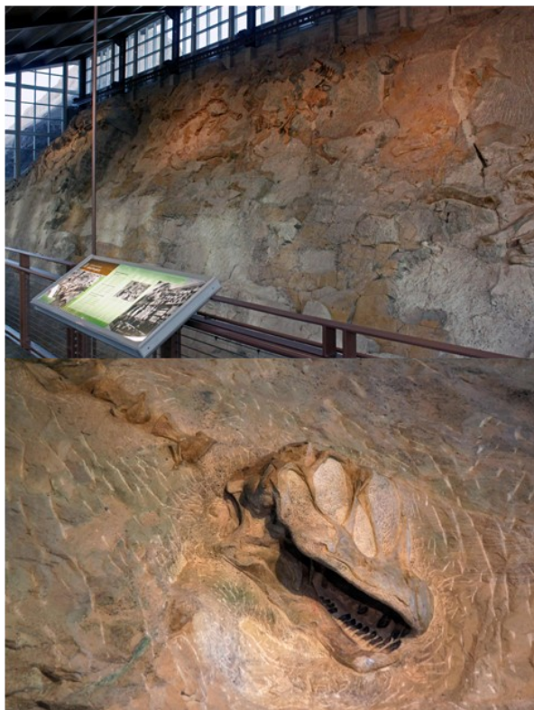
A lighted exhibit in front of a brownish gray wall filled with fossilized bones

The Quarry Exhibit Hall allows visitors to view the wall of approximately 1,500 dinosaur bones in a refurbished, comfortable space. Here, you can gaze upon the remains of numerous different species of dinosaurs from the Late Jurassic period, including Allosaurus , Apatosaurus , Camarasaurus , Diplodocus , and Stegosaurus , along with several others. There are even several places where you can touch real 150 million year old dinosaur fossils! Rangers are available to answer questions, help kids complete their Junior Ranger booklets, and occasionally provide talks on different topics related to the quarry or dinosaurs during the summer.